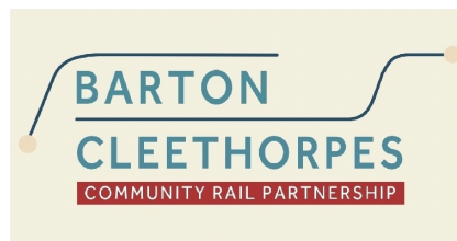
Art Along the Line